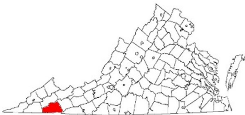
Figure 2: Washington County