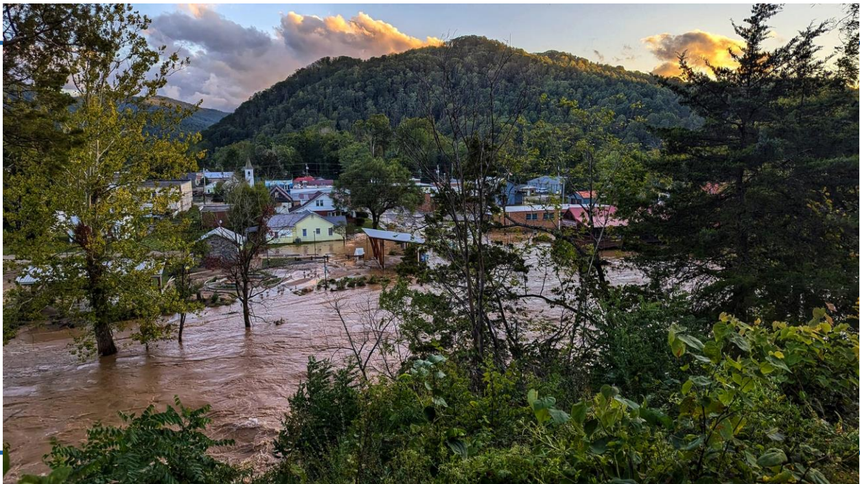
Figure 4: Overview of Flooding in the Town of Damascus

The following photographs were obtained from the Virginia Department of Emergency Management (VDEM) and aim to provide a small glimpse of the damage done to Washington and Giles counties.