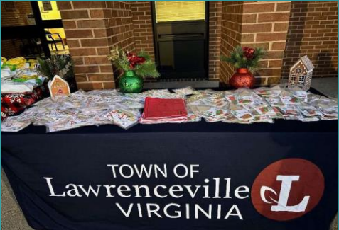
Town of Lawrenceville