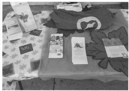
Town of Bedford