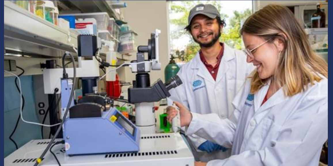
COgro Labs at Virginia Tech Corporate Research Center