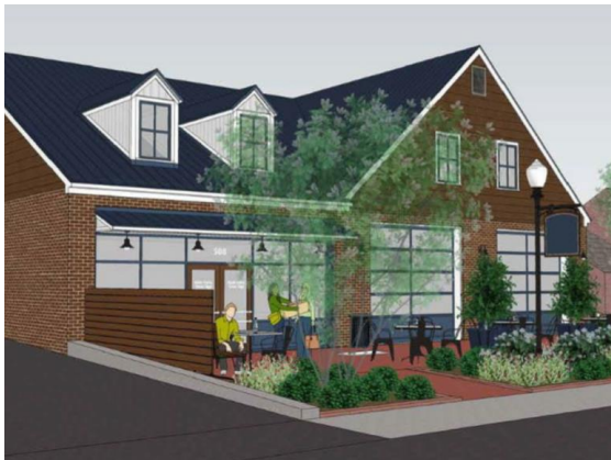
Altavista's Spark Innovation Center