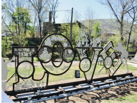
Clifton Forge Main Street's LOVE Sculpture Project