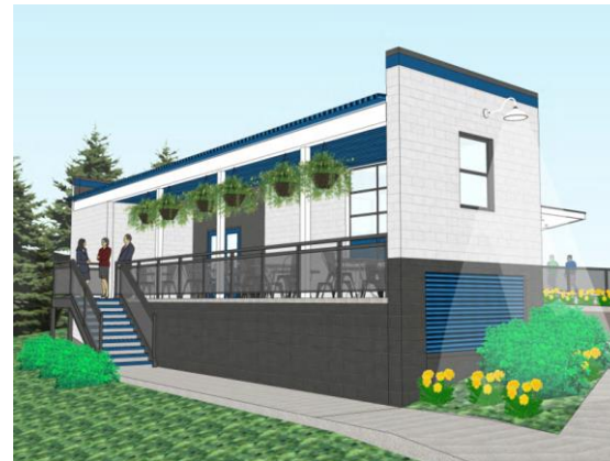
Orange's Earl's Glass Shop Building