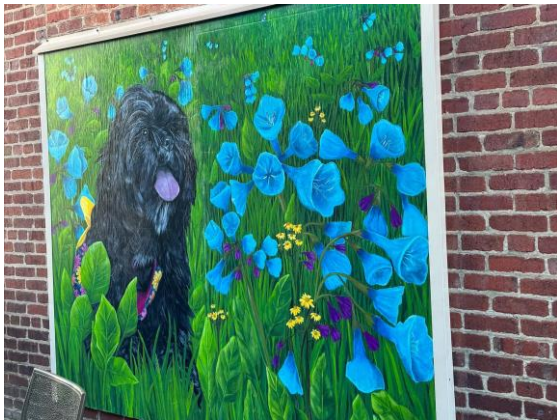
St. Paul Tomorrow, Inc.'s Outdoor Dining & Alleyway Improvement Project