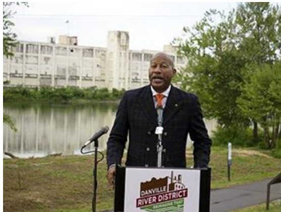
Danville's White Mill Building