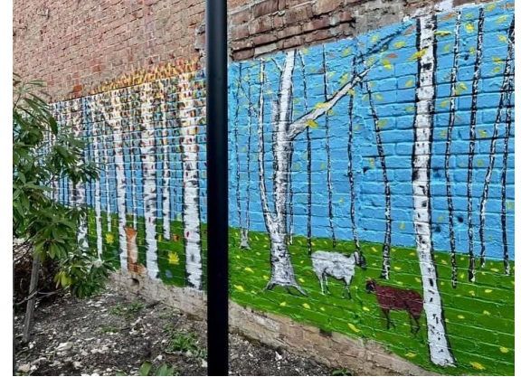
Pulaski on Main's Pocket Park and Mural Project