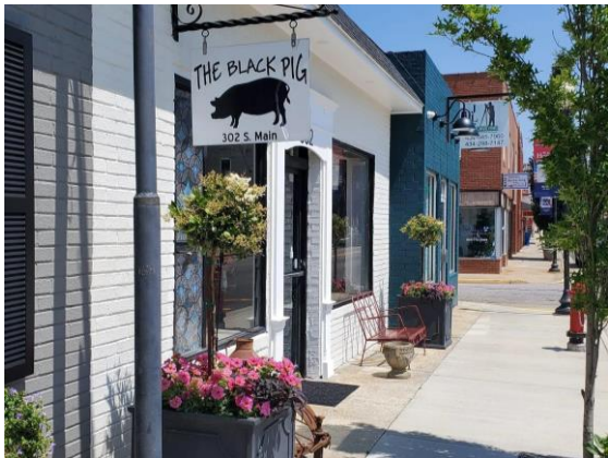
Downtown Blackstone, Inc.'s Façade Improvement Grant Project