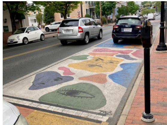
City of Winchester's Streetscape Improvement Project