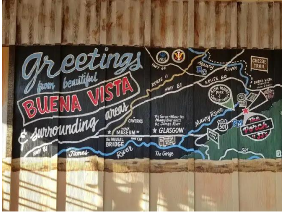
City of Buena Vista's Downtown Beautification Project