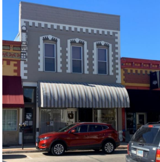
Farmville Downtown Partnership