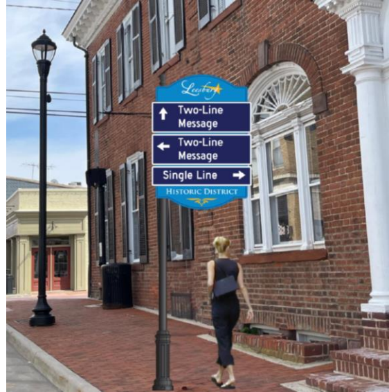
Town of Leesburg Wayfinding Update