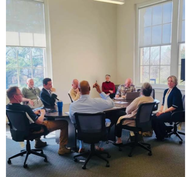
Louisa Forward Foundation Strategic Market Analysis