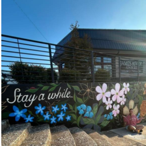
Town of Gate City Streetscape Project