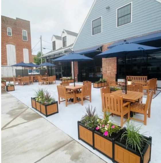
Altavista On Track