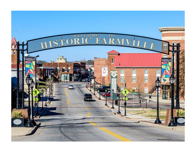
<u>Farmville Downtown</u> Partnership's Wayfinding