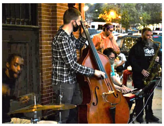
Main Street Petersburg's Community Listening and Planning Project