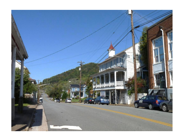
Nelson County's Lovingston Market Study