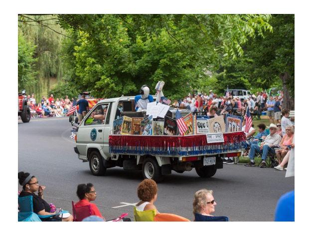
Staunton Downtown Development Association's Little Things