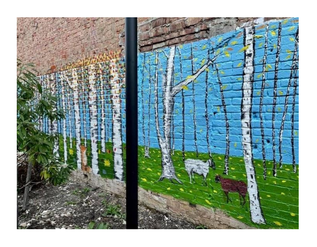
Pulaski on Main's Pocket Park and Mural Project